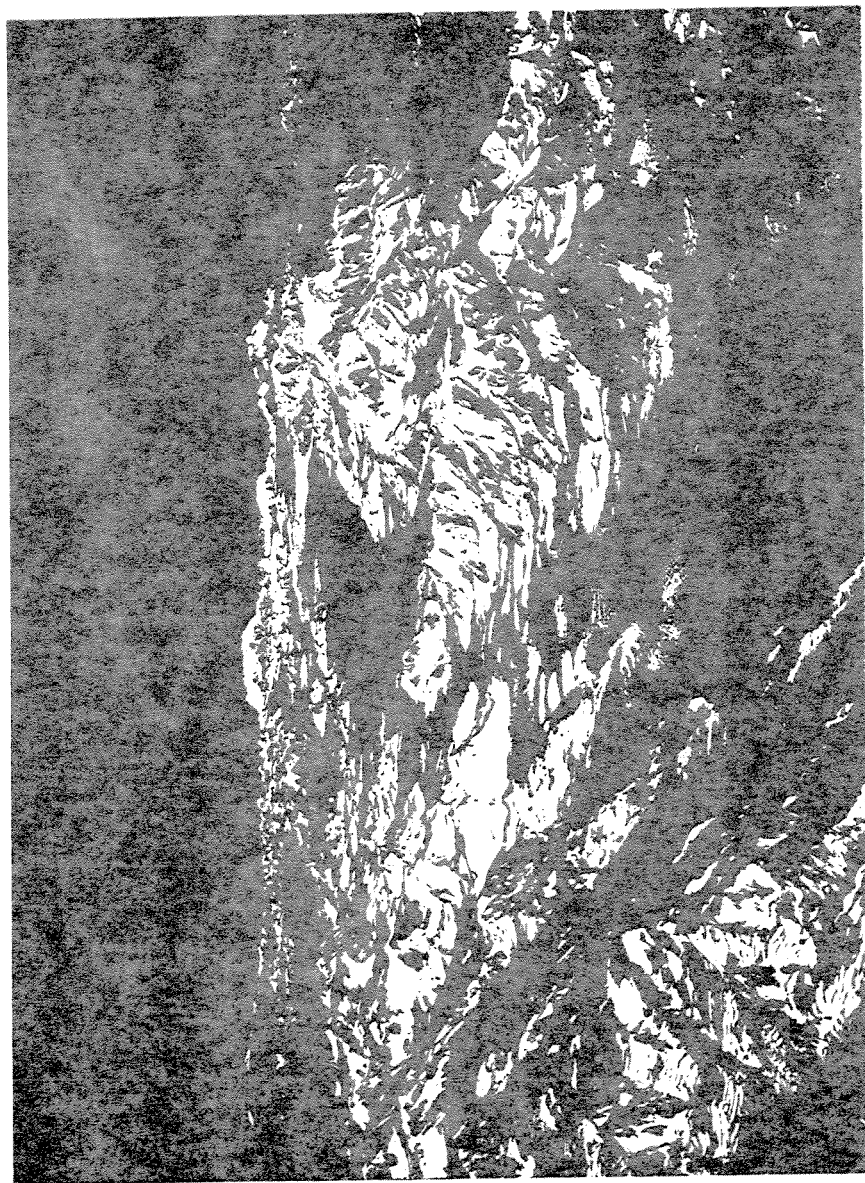
Fig. 1. The St. Elias district